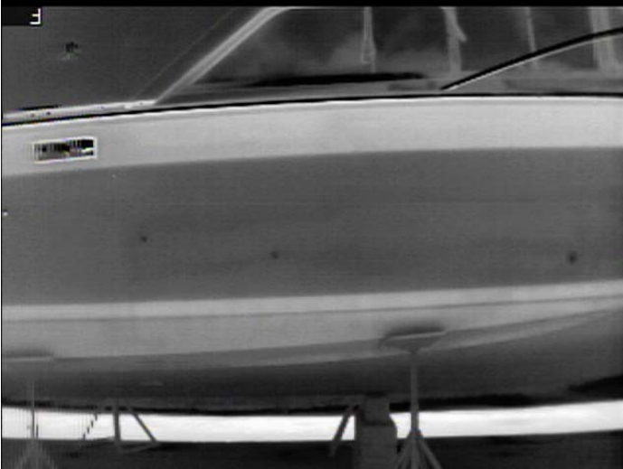
Black and White Infrared Image