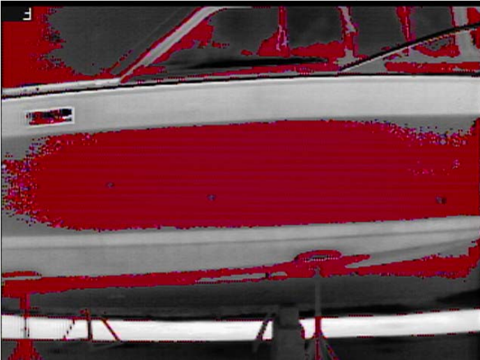
Iso-Therm Infrared Image