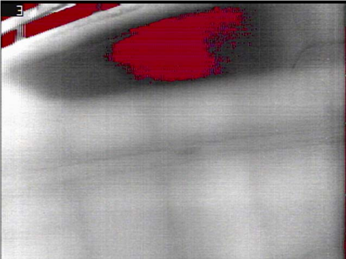
Iso-Therm Infrared Image