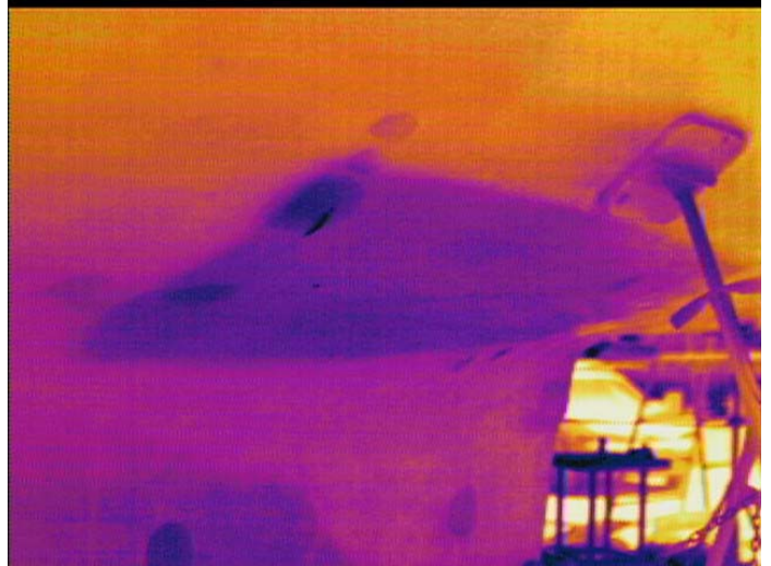
Color Infrared Image