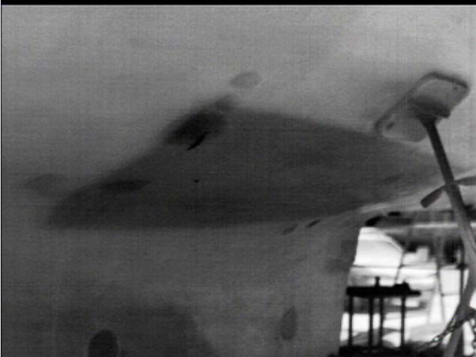
Black and White Infrared Image