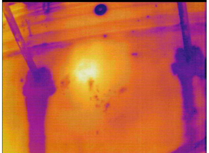
Color Infrared Image