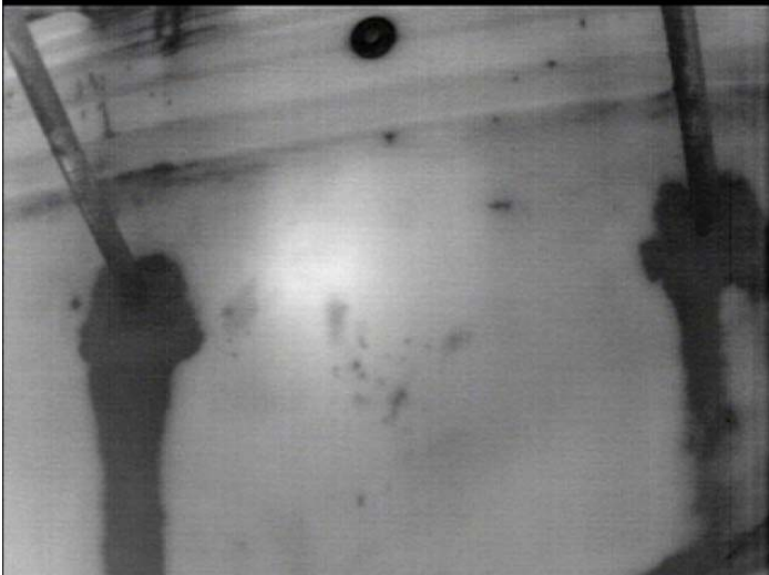
Black and White Infrared Image